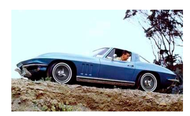
FIG 1: Richard's 1965 Corvette Stingray.