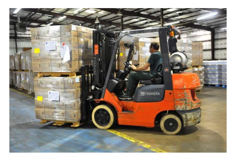
FIG 13: A forklift.