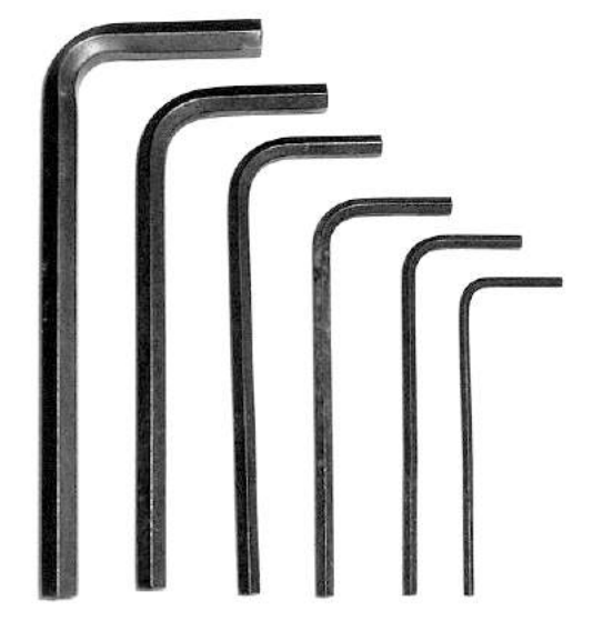
FIG 7: The hex wrenches Wyatt received from the Hexetron Tool-of-the-Month Club.