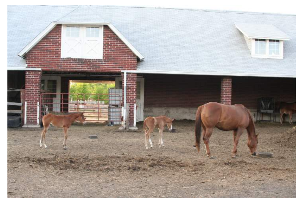
FIG 11: Ulena's riding stables welcomed adorable baby horses this year.