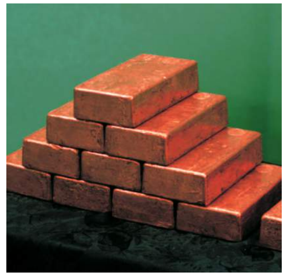
FIG 6: Some of the copper bullion from James's basement that was taken by Garth.