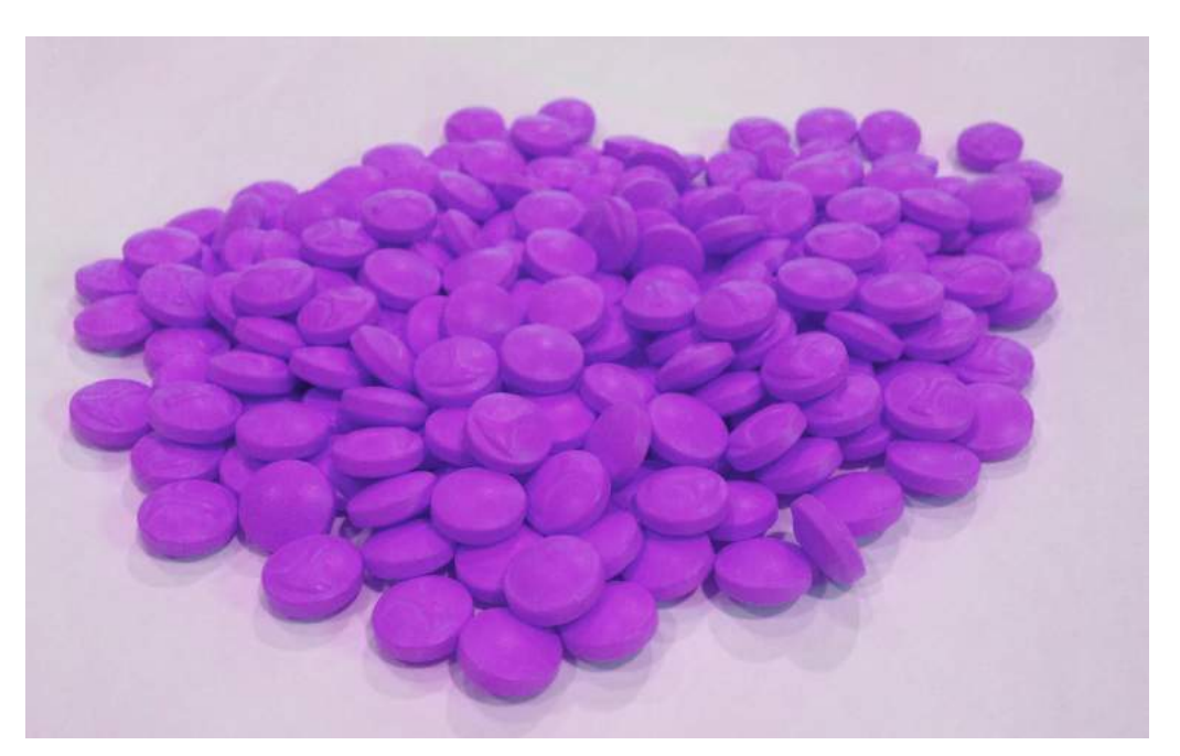
FIG 10: Some tablets that some pharmacists say look similar to nixaltangdiga.