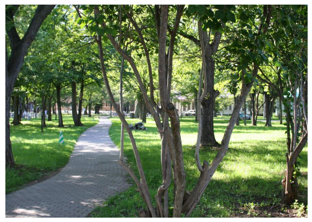
FIG 9: A day-time view of a different park.