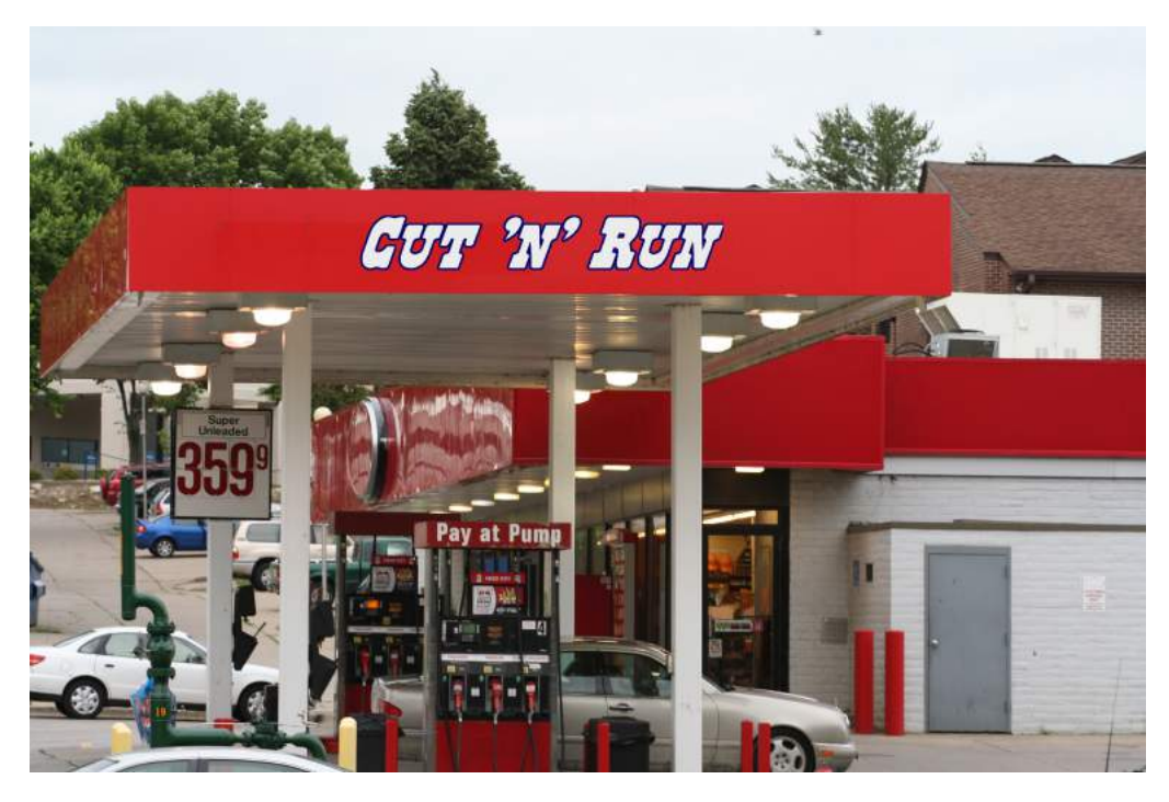
FIG 3: The worst way in town to earn minimum wage: The Cut'n'Run convenience store.