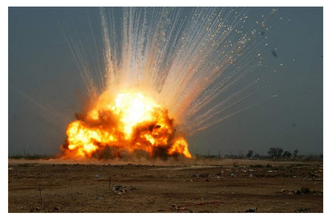
FIG 4: At Blastodyne Corporation, workplace safety is always priority no. 1.